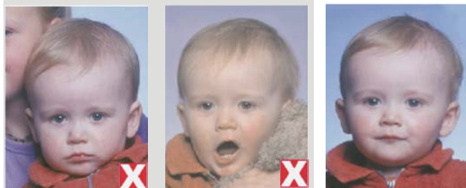
shows another person