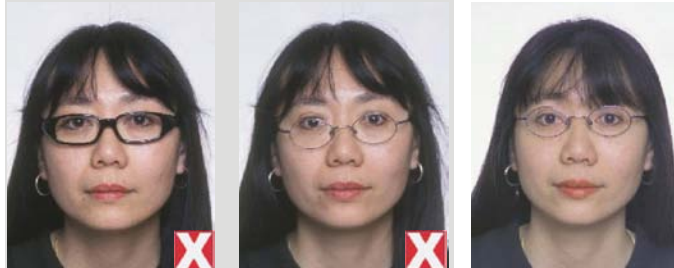
frames too heavy