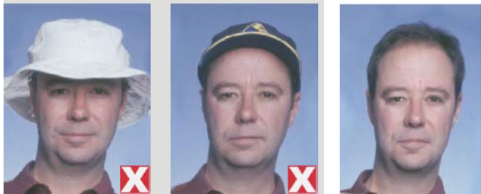
wearing a hat